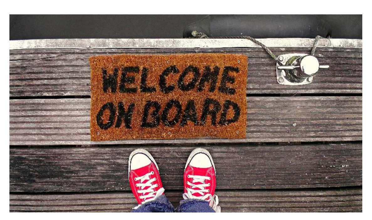
There were no new members or volunteers in October, but we are in conversations with a few interested parties. So, watch this space next month!

Also, if you know of someone who might be interested in WLLO Village,