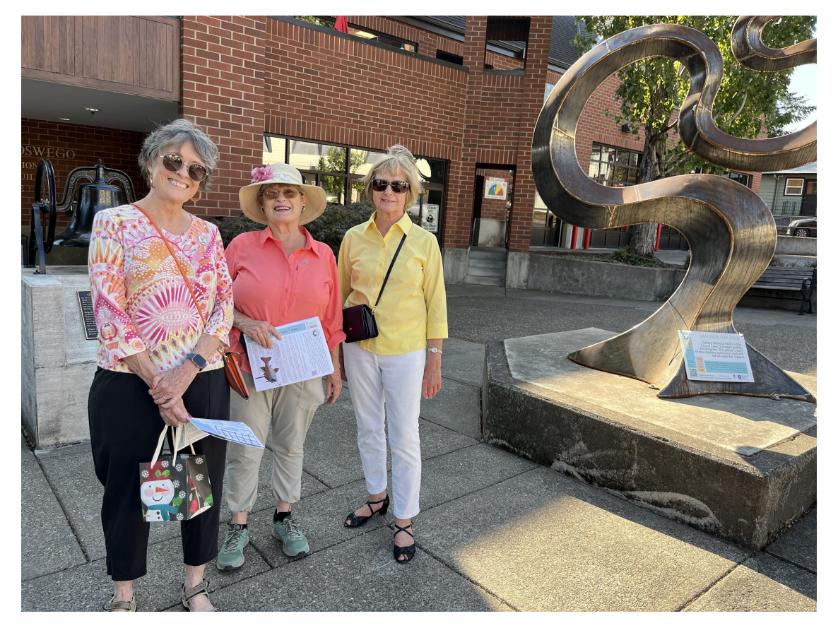
Here is a picture from the recent art walk WLLO organized in downtown Lake Oswego. Looks like it was a fun (and sunny) outing!