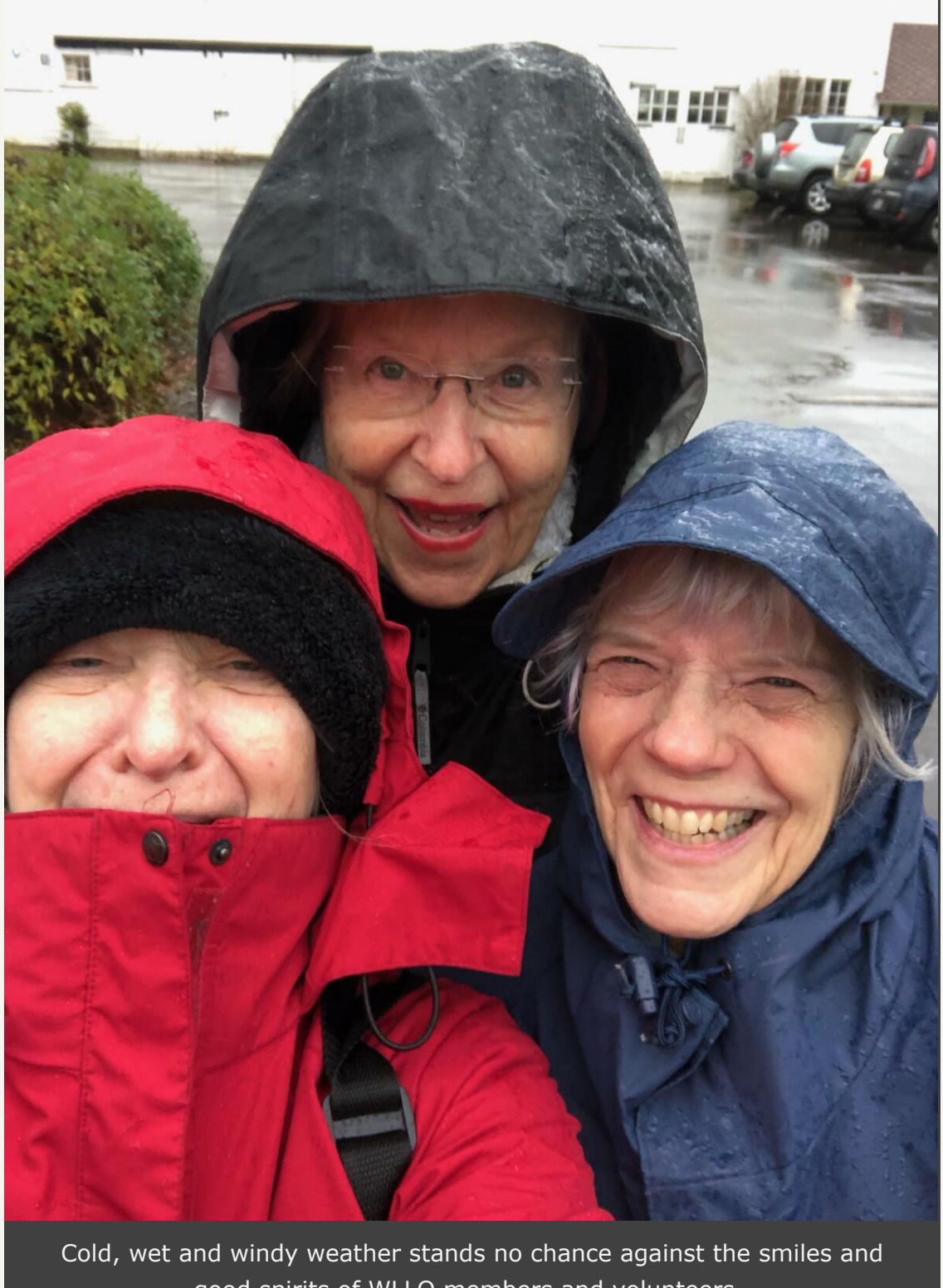
good spirits of WLLO members and volunteers.