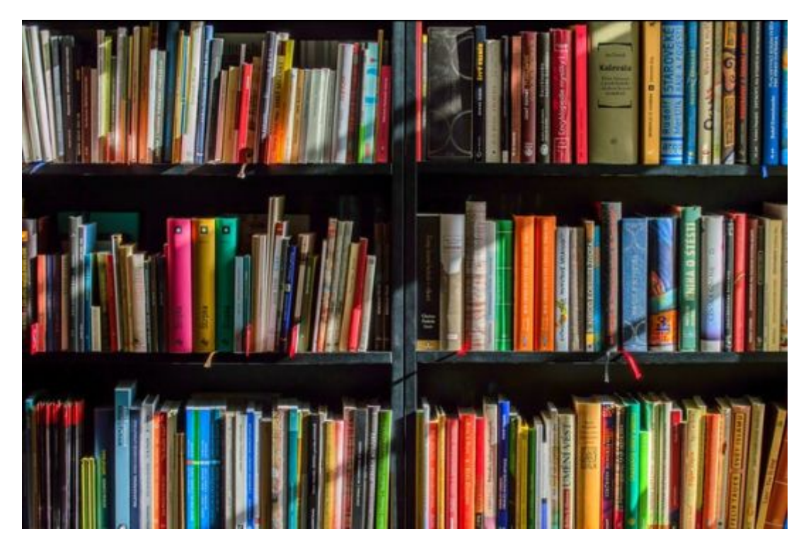
The NO-GUILT Book Club meets again on the second Tuesday of the month.

We will meet again at 10:30am at the upstairs tables at the Market of Choice in West Linn . This is upstairs above the deli/bakery and there is an elevator. We are a small group and would welcome new members and new ideas.